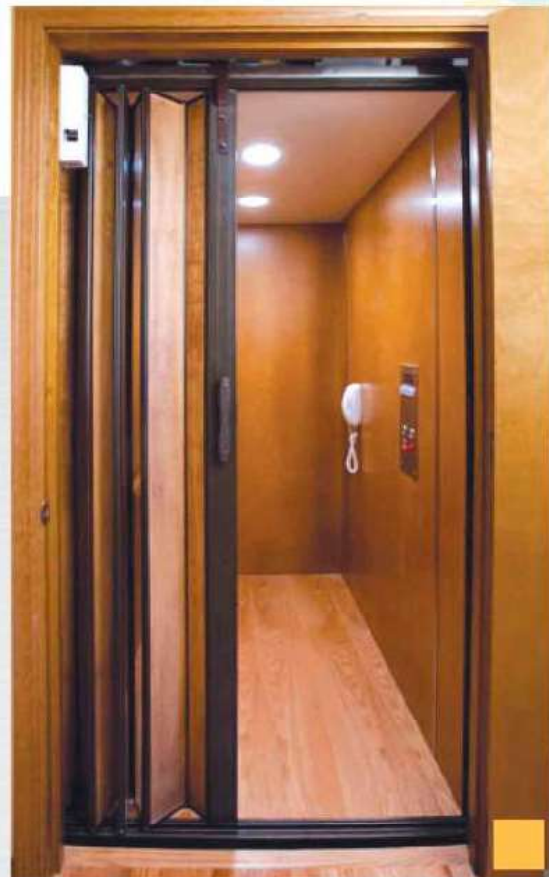
Designer Imperforated Door