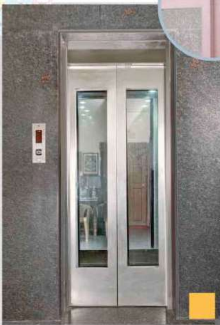
L. T. ADLC Auto-Door with Long Vision Glass Cut-Out