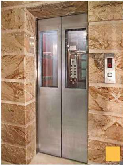
L. T. ADMC Auto-Door with Medium Vision Glass Cut-Out