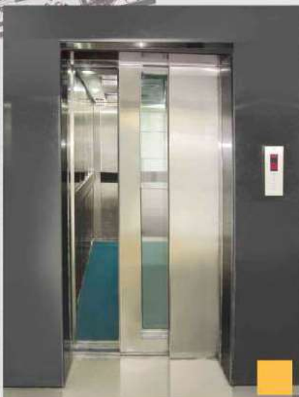
Side Opening Auto-Door