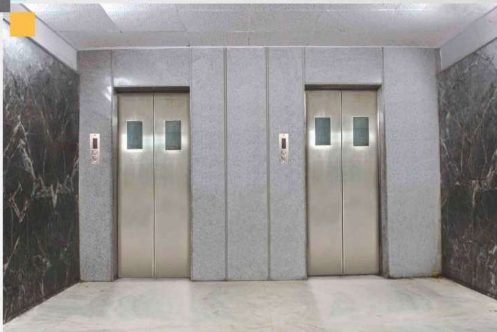
Auto-Door with Small Vision Glass Cut-Out