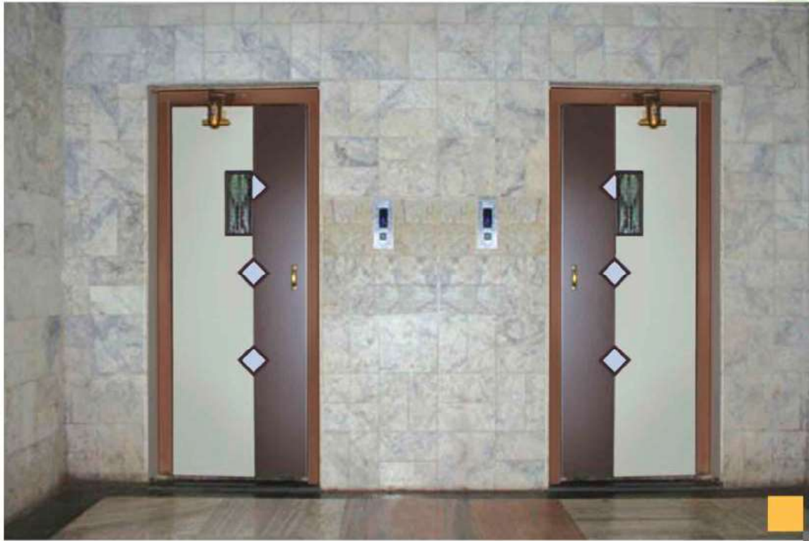
Dual-Shaft Swing Door