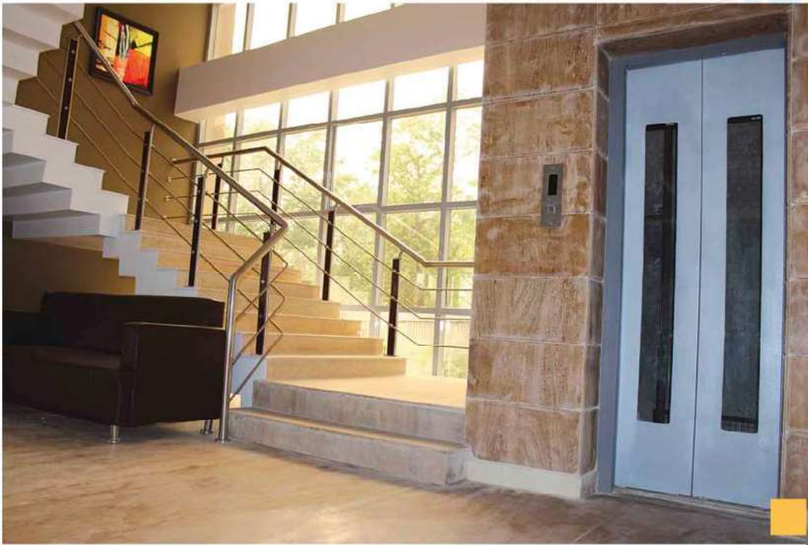
Center Opening Auto-Door

We serve our clients with an entire gamut of Automatic Doors. These are power-assisted doors, the act of pushing or pulling the door triggers the open and close cycle. Various sensors detect traffic is approaching – The pressure sensor reacts to the pressure of someone standing on it; An infrared curtain or beam shines invisible light onto sensors (if someone or something blocks the beam the door is triggered open); Safety sensors are used to prevent the door from colliding with an object in its path by stopping or slowing its motion. Our doors are installed at retail stores, shopping malls, schools, hotels office buildings, hospitals, airports and industrial facilities.