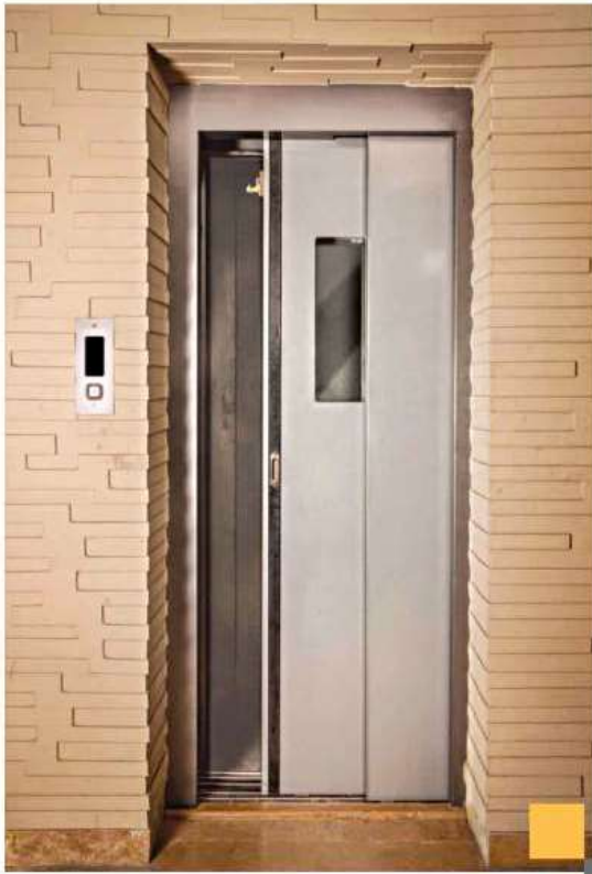
2 Fold Manual Telescopic Door