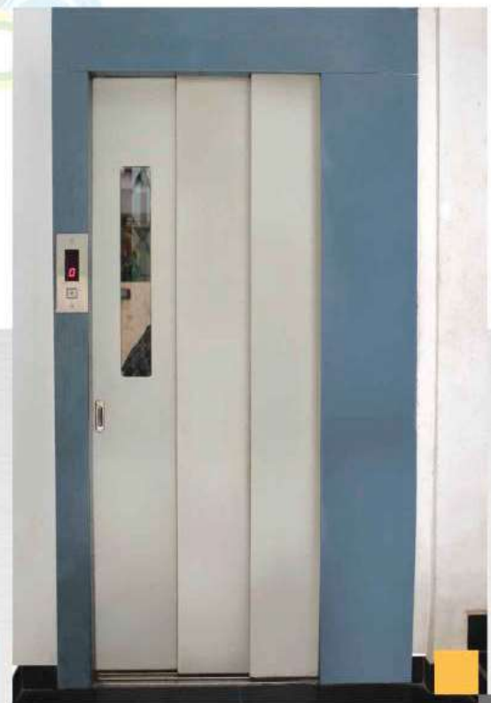
3 Fold Manual Telescopic Door

We are one of the finest manufacturers of telescopic doors in India. This product of ours is a market winner in all states and countries. They are perfect manual alternatives to a regular auto-door elevator.