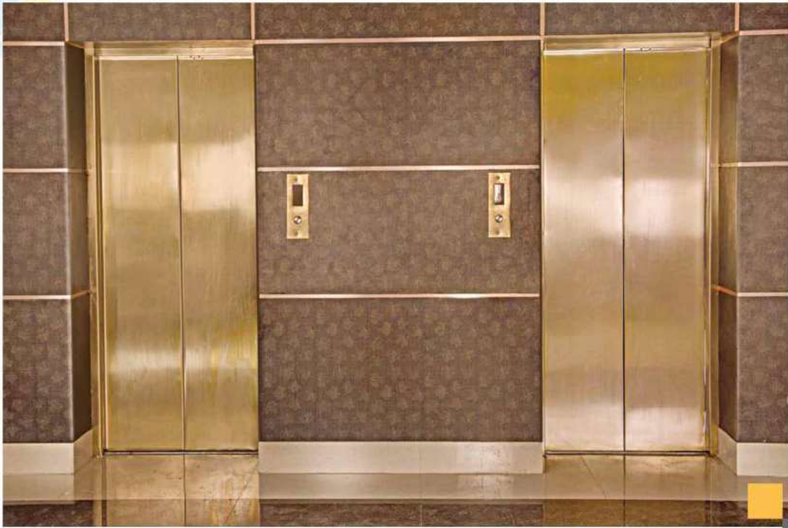
Auto-Door without Glass Cut-Out