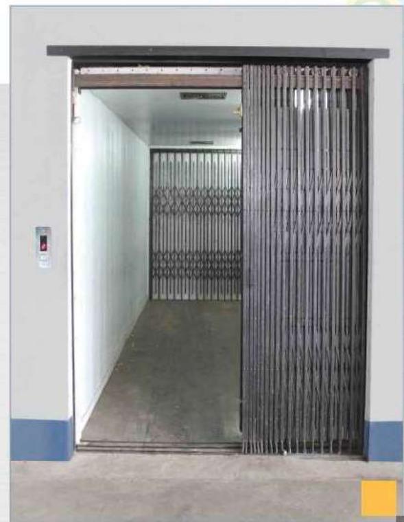
Both Side Collapsible Door